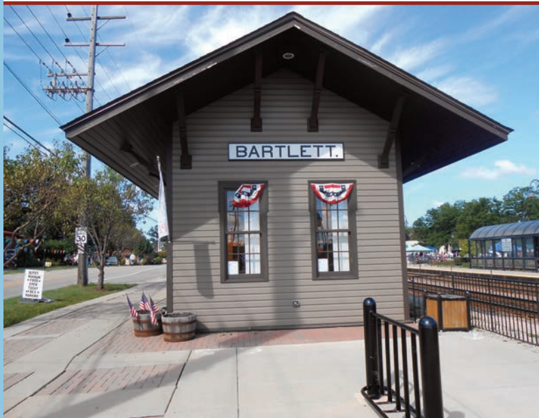
The Bartlett Depot Museum, built in 1873, is located at 100 W. Railroad Avenue.

Bartlett Depot Museum spring hours, through 5/31, are Tuesday and Thursday, noon to 5 p.m. and the first and third Saturday of the month, from 9 a.m. to noon. Free admission and free parking in the municipal lot across from the depot at Railroad and Oak Avenues.