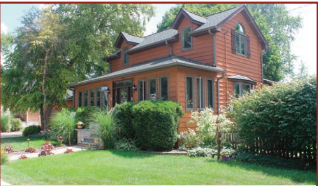
3 329 W. North Avenue

The Village of Bartlett is pleased to recognize the winners of the 2017 Pride In Ownership Awards.