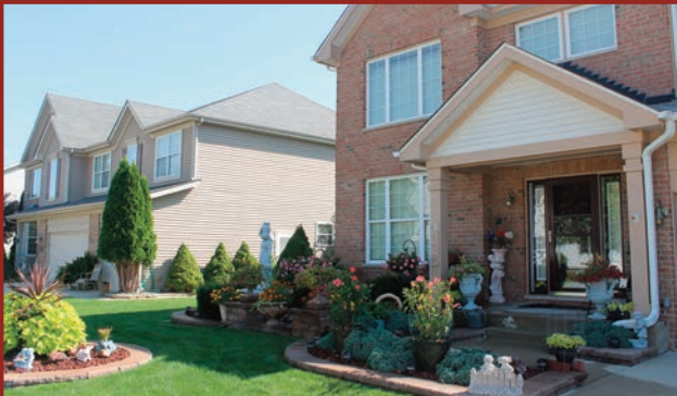
1 169 Primrose Lane