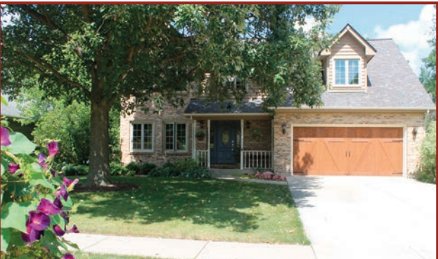
2 316 Ford Lane