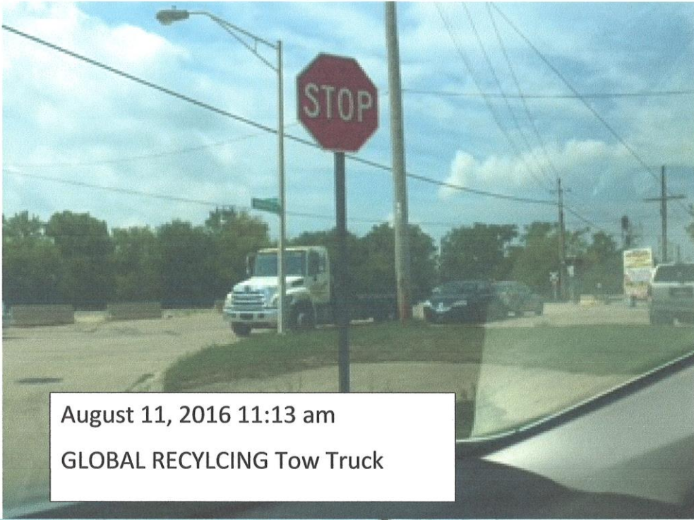
August 11, 2016 11:13 am GLOBAL RECYLCING Tow Truck