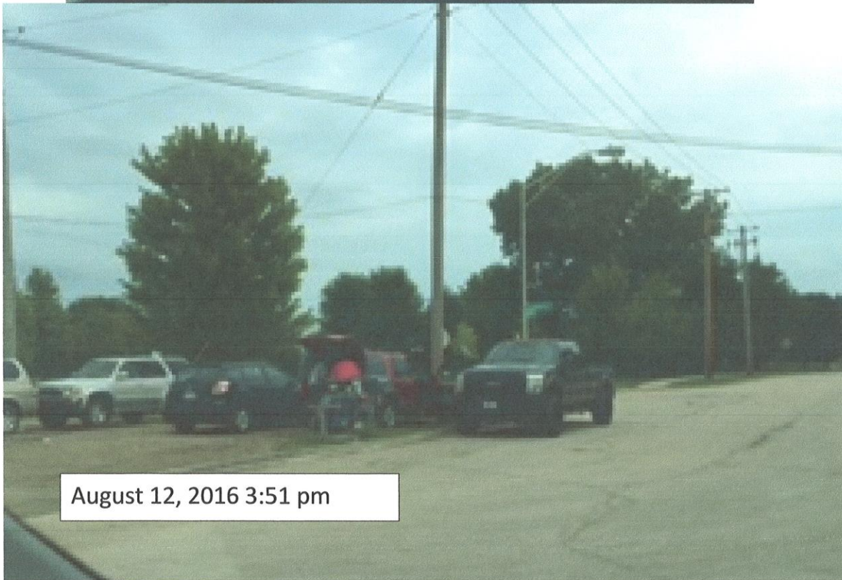
August 12, 2016 3:51 pm