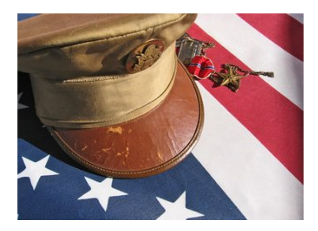
Please join Hanover Township for a Veteran Resource Fair at the Senior Center, 240 S. Route 59 in Bartlett, on