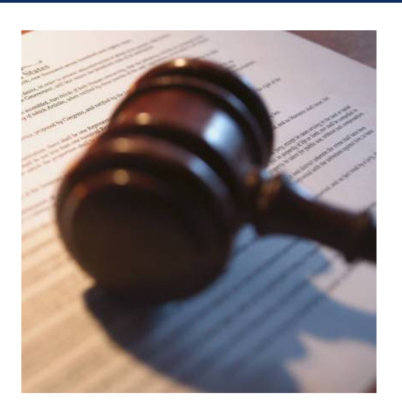
The Village of Bartlett Board will not meet