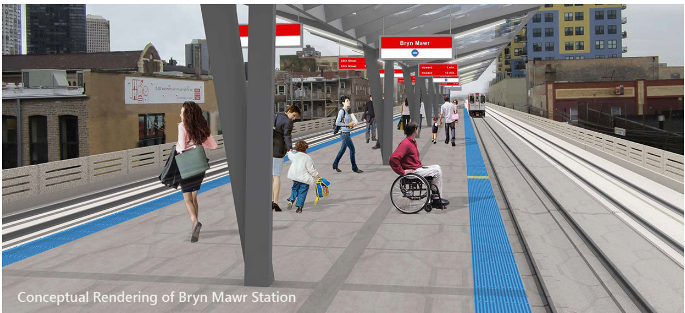
Conceptual Rendering of Bryn Mawr Station